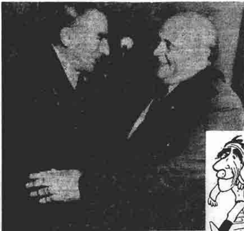
DEMIREL AND TÜRKES Holy alliance against the Left

Although the underground leftist organizations resorting to armed terror are numerous, they are completely dispersed due to inner conflicts or provocations. On the contrary, the extreme-rightist terror organizations are directed and oriented by a single chief: Ex-colonel Türkeş!